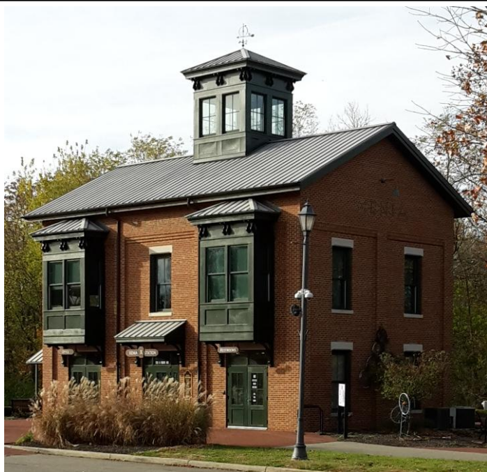
Xenia Train Station – A replica built in 1998. Compare to old photos inside